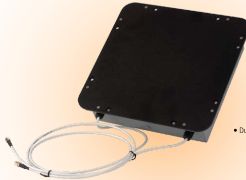
• Dual-slant Near Field Antenna

Laird Technologies' RF system engineering and antenna design technologies improve RFID read rates by optimizing the reader-tag communication link in this unique application environment.